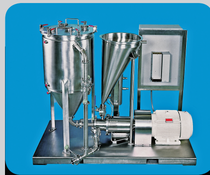
A portable, self-contained powder injection system can serve multiple process lines instead of just one.